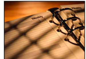
Take control & get organized.

By the end of this high energy day, you will have a clear picture of where your business will be in 90 days and a step by step GrowthCLUB Plan to get you there. Using your 13 week "road map" you and your coach will take your business from where you are today to where you want to be.